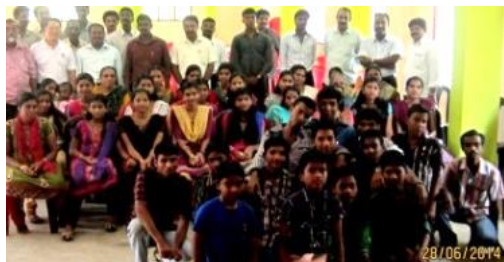
27-30 June 2014 – BB Introductory Seminar in Marthandam, Tamil Nadu, India; with 60 pastors and youth pastors.