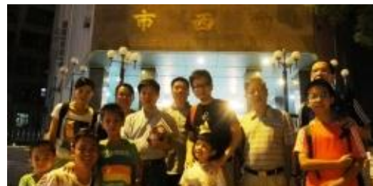
4-6 August 2014 – Working visit to Swatow, China where the first BB Company in Asia located.