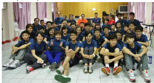
7-9 August 2014 – NCOs Leadership Training for 50th Hong Kong & 2nd Macau companies