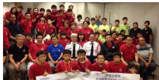
9 August 2014 – BB Cambodia Ministry Introductory Seminar in Hong Kong