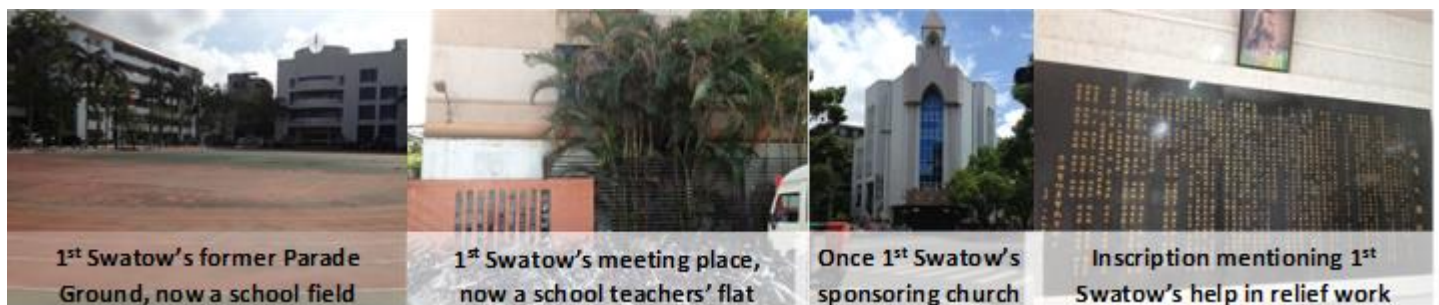
1 st Swatow's former Parade Ground, now a school field

Two months after my trip to India, I was honoured to join three BB officers from 50th Hong Kong Company to visit the city of Shantou (Swatow) in Guangdong province, China on 4-6 August 2014. The visit was made possible with the cooperation from the Christian Church in Shantou West, the church where the former 1st Swatow Company was based. I was also able to visit two important locations of historical significance to the BB: the Parade ground of 1st Swatow Company, which is now occupied by a school; and the Salt Rock Christian Church, with which the 1st Swatow Company Boys were involved in the relief and rescue work in the aftermath of a tsunami and a strong typhoon. A write-up mentioning the BB's involvement in the relief work remains on the stone wall in the church premises. Let us continue to pray that the BB will be re-established in Swatow again one day!