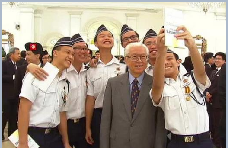
Taking a selfie with Singapore President Tony Tan Keng Yam!

Six recipients were awarded the Boys' Brigade Singapore's highest accolade – The President's Award – by Singapore President Tony Tan Keng Yam on 14 July.