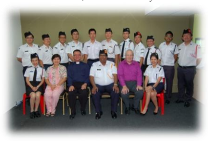
A photo to remember

For all the wonderful blessings bestowed on our BB ministry, to God be all glory and Praise!