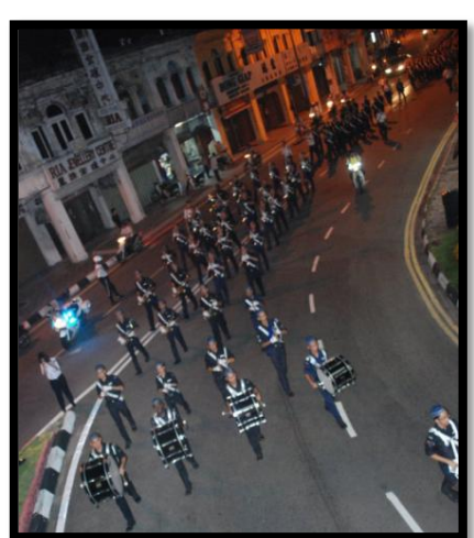
Route March along Penang Street

The fourth day was fun and relaxing as well as participants can decide which part of the Penang they would like to visit from its shopping malls, to butterfly farms, to a ferry "cruise" to Butterworth and back and even a buffet with the King of Fruits.