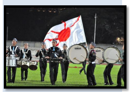
Marching Band Competition

1st Johor Bahru Company was declared the overall champion for this Pesta.