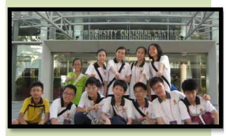
In front of NUS

This conference benefitted me in a great way because not only I learnt a lot but I also had the opportunity to meet and interact with many members from other BB companies.