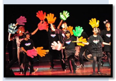
Group Singing Competition

The first two days of Pesta was focused on the National Competitions comprised of singing, band and footdrill competitions with the introduction of the dance category this Pesta. All teams performed well and gave their very best.