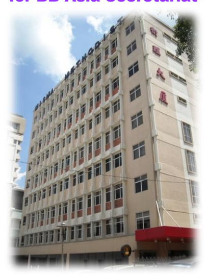
Wisma Methodist building

After receiving a very good offer from the President of the Chinese Annual Conference of The Methodist Church in Malaysia, BB Asia signed the tenancy agreement for an office space with the management of Wisma Methodist in Kuala Lumpur.